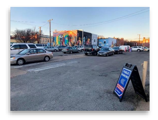
100 E Marshall Street

http://eservices.ci.richmond.va.us/applications/propertysearch/detail.aspx?pin=N0000061023